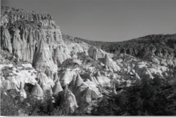
Tent Rocks, Jemez Mountains.