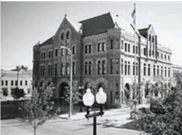
US District Courthouse, Sioux Falls, SD

From top left: Tent Rocks photo courtesy of Michael Dechter; Courthouse, Sioux Falls, South Dakota, photo courtesy of General Services Administration, http://rmrpbs.gsa.gov/internet/PBSWeb.nsf/0/a704c21a7427f8d4872569b50079ac3d?OpenDocument