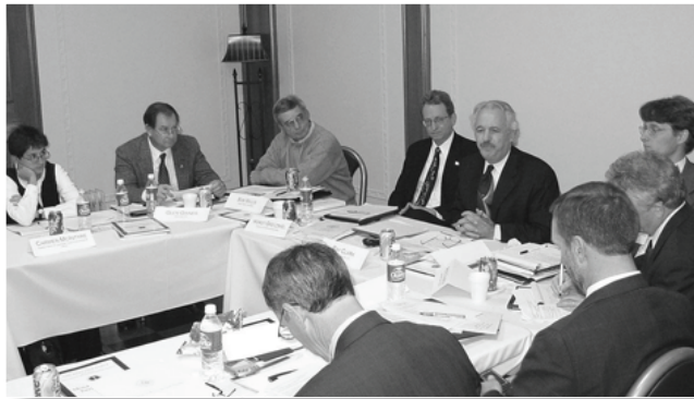
Southern Regional NEPAR roundtable discussion on the NEPA Task Force report Modernizing NEPA Implementation